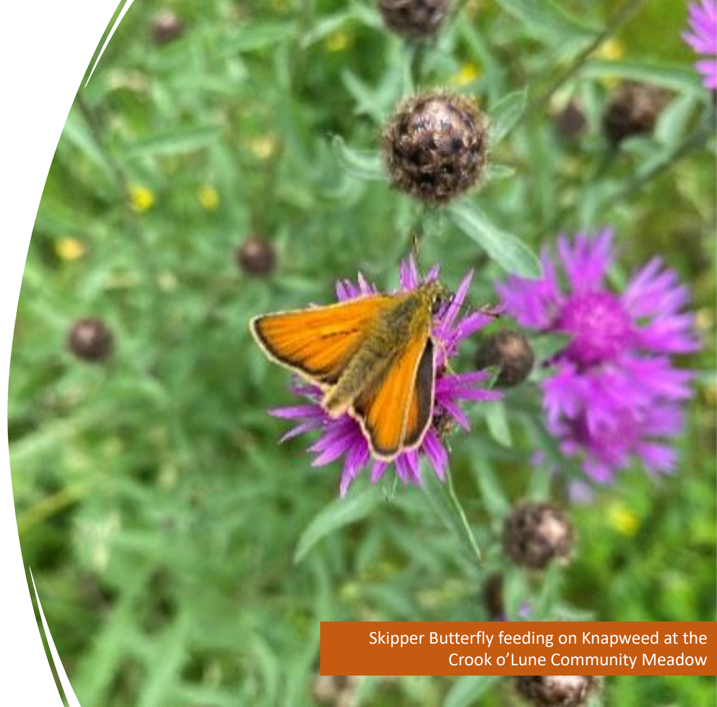
Skipper Butterfly feeding on Knapweed at the Crook o'Lune Community Meadow