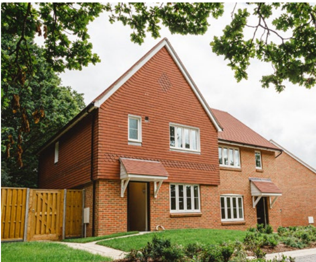
Rural areas face a unique set of challenges in improving the availability and affordability of housing.

We want to make sure that that the dream of home ownership is open to people working and living in rural areas; that people can stay in the communities where they grew up, close to friends, family and jobs and that key workers are able to live in the communities they serve. Rural areas face a unique set of challenges in improving the availability and affordability of housing of all tenures. Sites for development tend to be smaller – often fewer than 10 units – and while that is appropriate to a rural location, they can be difficult to secure, more expensive to develop and slower to be delivered. Rural Housing Enablers based in rural areas have been shown to be an effective way to facilitate developments and the use of in-kind, on-site developer contributions to provide affordable housing within small communities.