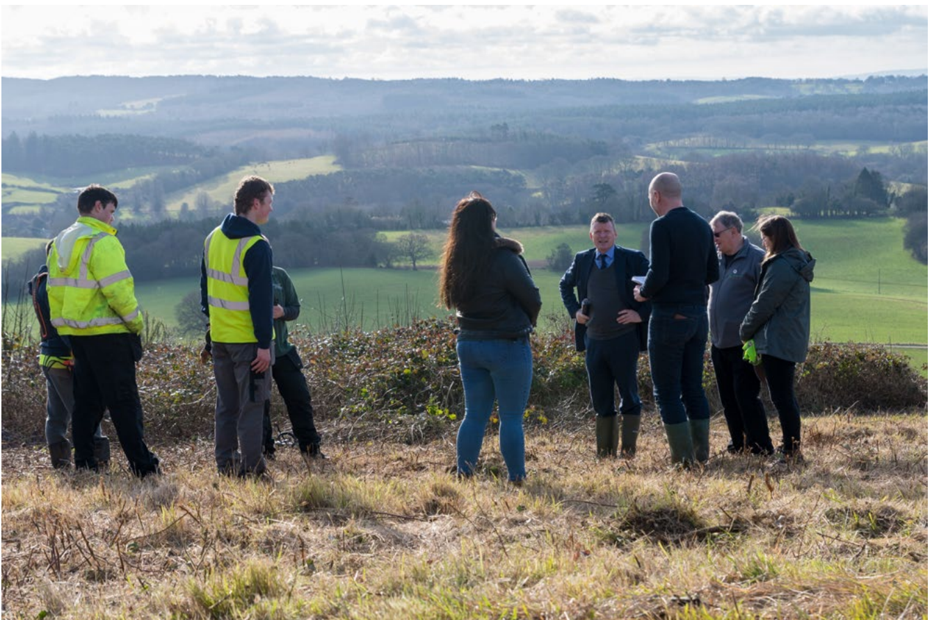
Lord Benyon meets volunteers at Surrey Hills Area of Outstanding Natural Beauty.

Some of the highlights this year have seen Lord Benyon visiting rural housing developments, local businesses and nature recovery projects and meeting local residents, volunteers and park rangers in National Parks and Areas of Outstanding Natural Beauty. Destinations have included Dartmoor National Park, the Surrey Hills Areas of Outstanding Natural Beauty, the Lake District National Park and the North York Moors National Park. Lord Benyon also attended Bucklebury village hall during Village Halls Week and witnessed drone technology in action on a visit to Avon and Somerset Police in Taunton.