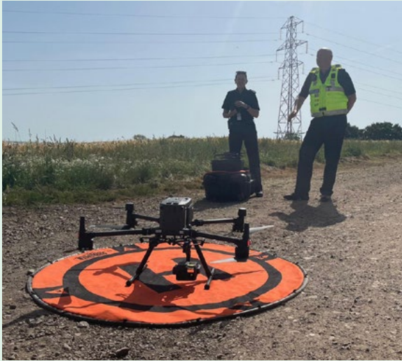
Avon and Somerset police use a special drone to tackle rural crime.

Avon and Somerset Police has unveiled a special drone being used to tackle rural crime.