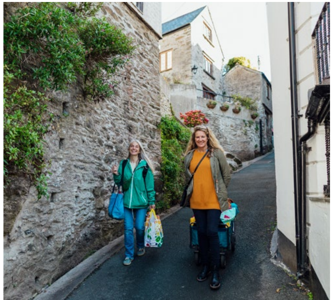
In rural areas, access to services, shops, education or work can be limited for those without private transport.