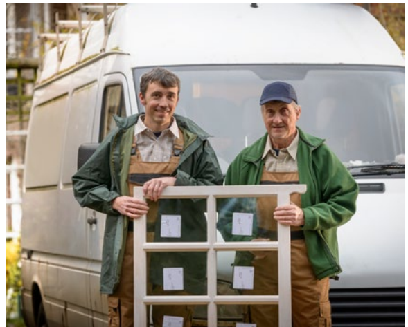
The rural economy is based on a bedrock of small businesses, such as this father and son building firm in North Yorkshire.