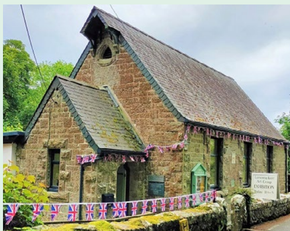
Lamorna Village Hall in Cornwall is a thriving venue for community events, live music, small theatre, workshops and clubs.

In recognition of this, a Platinum Jubilee Village Hall Improvement Grant Fund will soon be launched, providing £3 million of capital grant funding to support the modernisation and improvement of village halls, ensuring they will continue to deliver a legacy of lasting benefit to the rural communities that they serve.