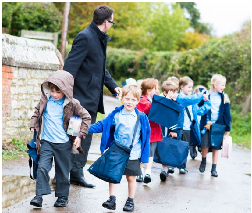
Schools help to provide a focal point to rural communities and are afforded extra protections against closure.

Smaller rural schools found in rural areas do not have the same opportunities to find efficiencies as those elsewhere. A sparsity factor was therefore introduced in the National Funding Formula for schools . As a result, £95 million has been allocated to small, remote schools in the financial year 2022 to 2023, an increase of £53 million from the year before. The amount of additional funding which these schools can attract has increased to up to £55,000 for primary schools, and up to £80,000 for secondary schools – in both cases, a £10,000 increase from the year 2021-22.