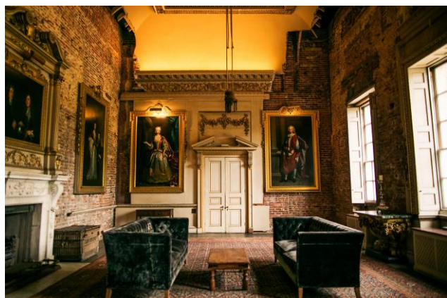
Save the date - Gillingham & Shaftesbury Show.

We'll be returning to Gillingham & Shaftesbury Show for the CLA Show Breakfast on Wednesday 14 August 2024 (8am-10am). This event is free to attend and includes a full English breakfast. Full details can be found on the CLA website.